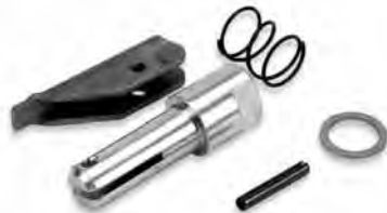
FORK PIN KIT