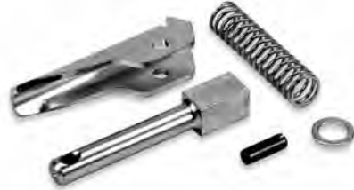
FORK PIN KIT