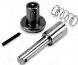
FORK PIN KIT