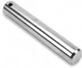
WHEEL FORK PIN-FREEZER CORROSION

Overall Length ..... 5.980" O.D. .... .999"