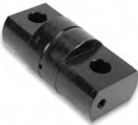
MAST LOCKING PIN

Overall Length ..... 4.920" O.D. .... 2.300" Hole Diameter ..... .687"