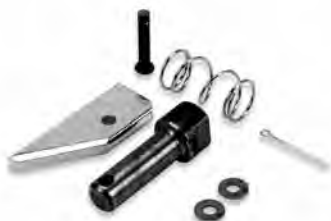
FORK PIN KIT