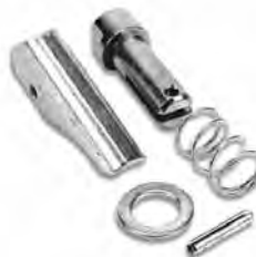
FORK PIN KIT