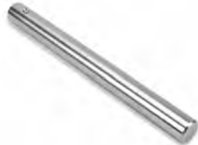
WHEEL FORK PIN-FREEZER CORROSION

Overall Length ..... 9.030" O.D. .... .873"