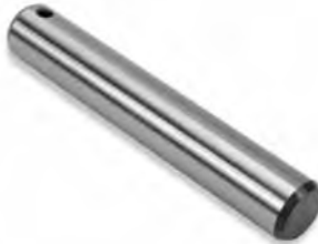
WHEEL FORK PIN

Overall Length ..... 5.980" O.D. .... .999"