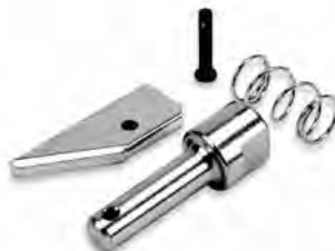
FORK PIN KIT