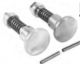
FORK PIN KIT