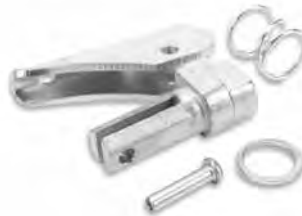
FORK PIN KIT