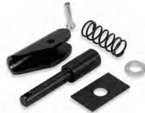
FORK PIN KIT