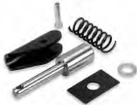
FORK PIN KIT