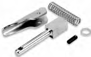
FORK PIN KIT