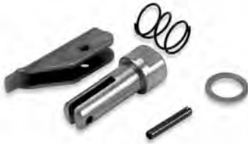
FORK PIN KIT