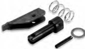
FORK PIN KIT