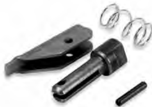
FORK PIN KIT