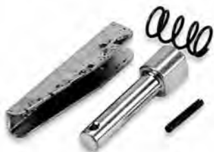
FORK PIN KIT