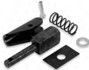
FORK PIN KIT