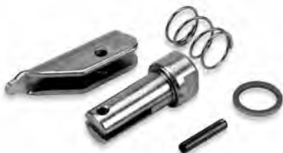
FORK PIN KIT