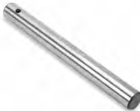
WHEEL FORK PIN

Overall Length ..... 7.150" O.D. .... .747"