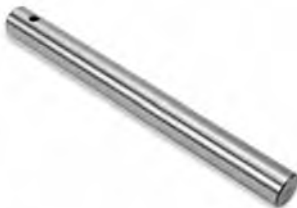
WHEEL FORK PIN

Overall Length ..... 9.030" O.D. .... .872"