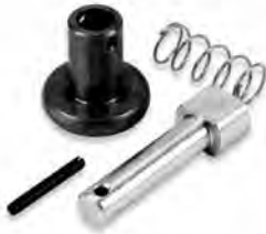
FORK PIN KIT