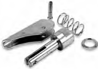
FORK PIN KIT