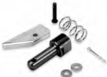
FORK PIN KIT