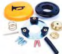
HORN BUTTON KIT