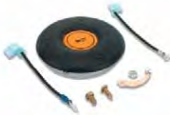
HORN BUTTON KIT