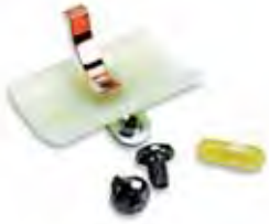
HORN BUTTON KIT