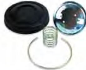
HORN BUTTON KIT