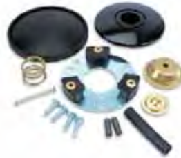
HORN BUTTON KIT