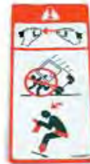
DECAL-FASTEN SEAT BELT