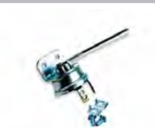
BACK-UP ALARM SWITCH

Type ..... Light Duty Amps ..... 5 Voltage ..... 12VDC Electrical Specification ..... Single Pole, Normally Open Body Type ..... Metal Manufacturer # ..... SW10