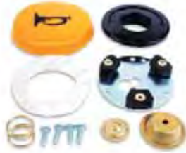
HORN BUTTON KIT