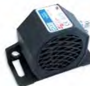
BACK-UP ALARM (SMART)

Voltage ..... 12-48V Decibel Rating ..... 77-97dB Type ..... Self Adjusting Manufacturer # ..... SA951