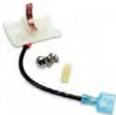
HORN BUTTON KIT