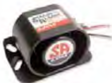
BACK-UP ALARM (SMART)

Voltage ..... 12-48V Decibel Rating ..... 82-102dB Type ..... Self Adjusting Manufacturer # ..... SA931