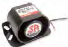
BACK-UP ALARM (SMART)

Voltage ..... 12-24V Decibel Rating ..... 82-107dB Type ..... Self Adjusting Manufacturer # ..... SA901