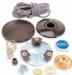
HORN BUTTON KIT