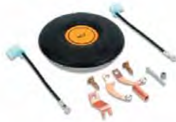
HORN BUTTON KIT