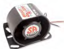
BACK-UP ALARM (SMART)

Voltage ..... 12-36V Decibel Rating ..... 82-107dB Type ..... Self Adjusting Manufacturer # ..... SA907