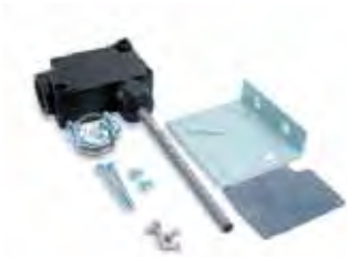
BACK-UP ALARM SWITCH

Type ..... Heavy Duty Amps ..... 5 Voltage ..... 12VDC Electrical Specification ..... Single Pole, Double Throw Body Type ..... Rugged plastic Manufacturer # ..... SW15SP