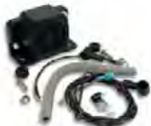
BACK-UP ALARM KIT

Type ..... Fixed Decibel Voltage ..... 12-72V Decibel Rating ..... 90dB