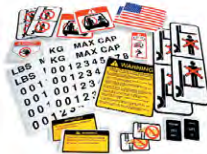
DECAL WORLD KIT