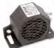
BACK-UP ALARM (SMART)

Voltage ..... 12-24V Decibel Rating ..... 82-102dB Type ..... Self Adjusting Manufacturer # ..... SA950