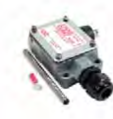
BACK-UP ALARM SWITCH

Type ..... Extra Heavy Duty Amps ..... 5 Voltage ..... 12VDC Electrical Specification ..... Single Pole, Double Throw Body Type ..... Spark proof metal Manufacturer # ..... SW30