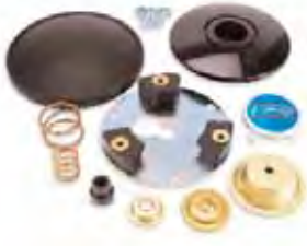
HORN BUTTON KIT